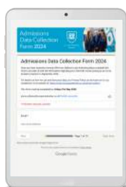
Admissions Data Collection Form 2024

By Friday 31 May you must have completed and submitted the following online forms, found on our academy website: swinton.coopacademies.co.uk/primary-transition-2022/ or by using the URL links below: